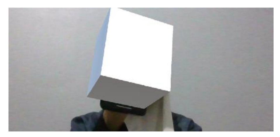
Figure 1. Build a cube using unity